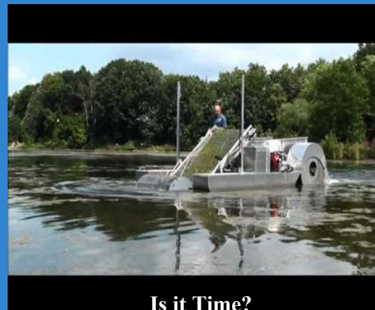
Is it Time?

There is no conclusion to our story until we get a handle on the bad blooms in Clear Lake. Other lakes throughout the United States have purchased equipment or tried many removal processes to battle their situation. With Clear Lake being over 100 miles of shoreline, this will be a more difficult challenge but one our county must address. Is it time to look into this type of investment?